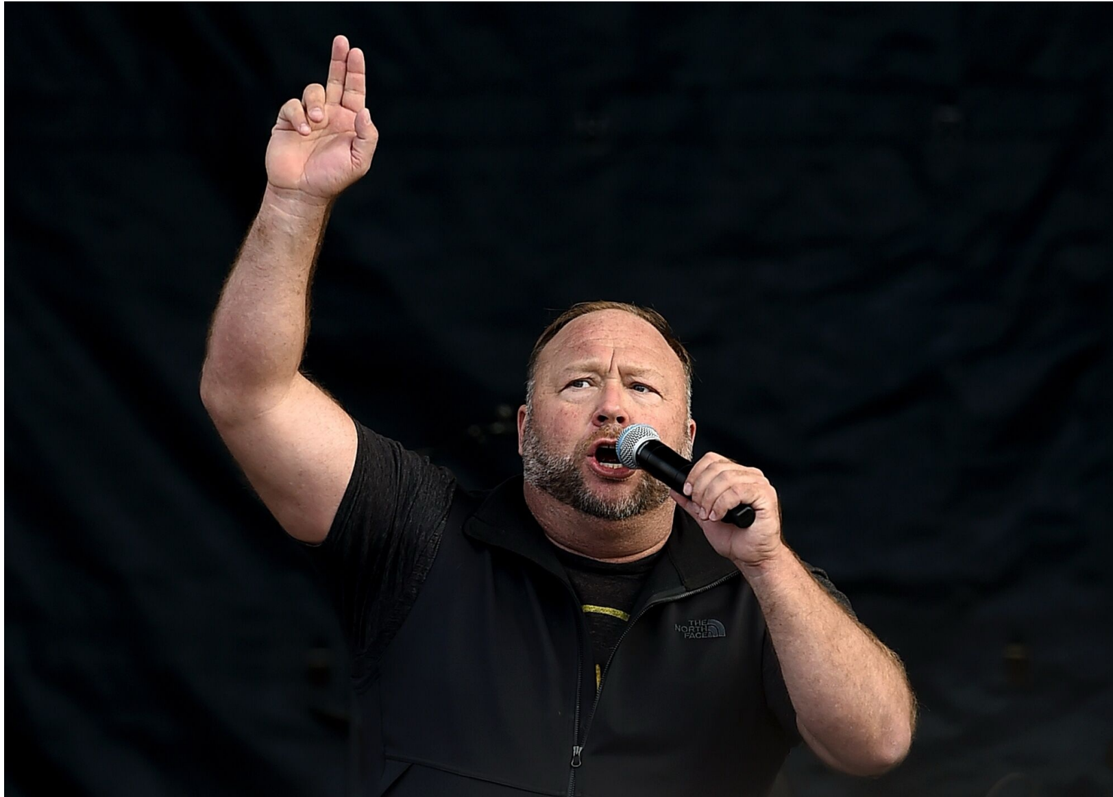
Alex Jones (Free Speech Sys.)